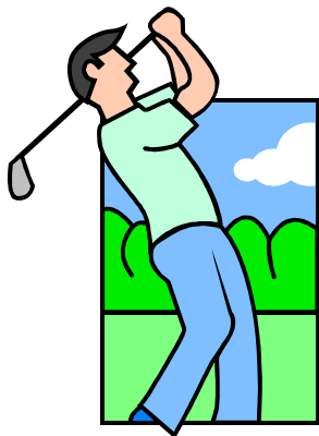
KOC to Sponsor Golf Outing at Belvedere Country Club